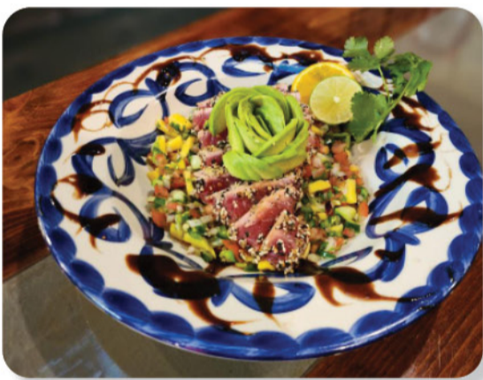
Ceviche de Atun