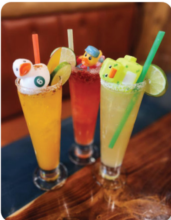
Pie de Foto