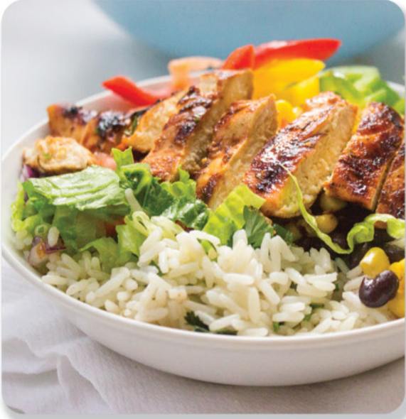
Grilled Chicken Bowl

TINGA +2 FAJITA VEGGIE +2 SHRIMP +4 CALABACITAS SQUASH +2 Add queso dip +2